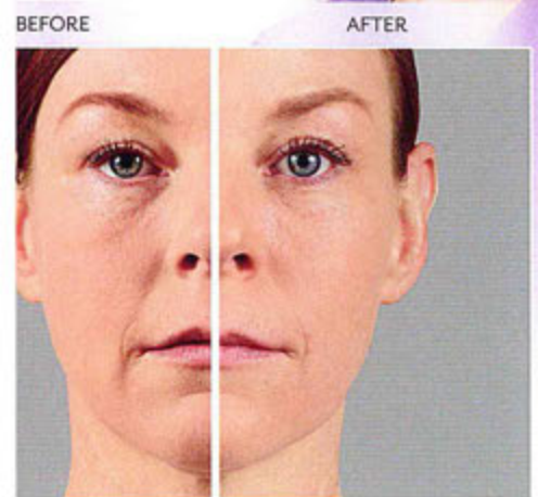
Individual results may vary.

photos of paid model taken before treatment and 1 month nt. A total of 2.6 mL of JUVÉDERM VOLUMA ® XC was he cheek area. olume of JUVÉDERM VOLUMA ® XC injected during the was 6.8 mL to achieve optimal correction for the cheek area.